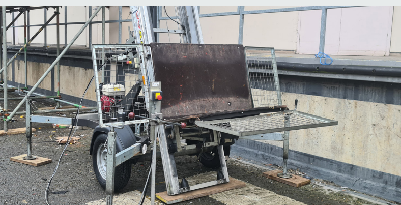
Adjustable Platform – unloading at the top