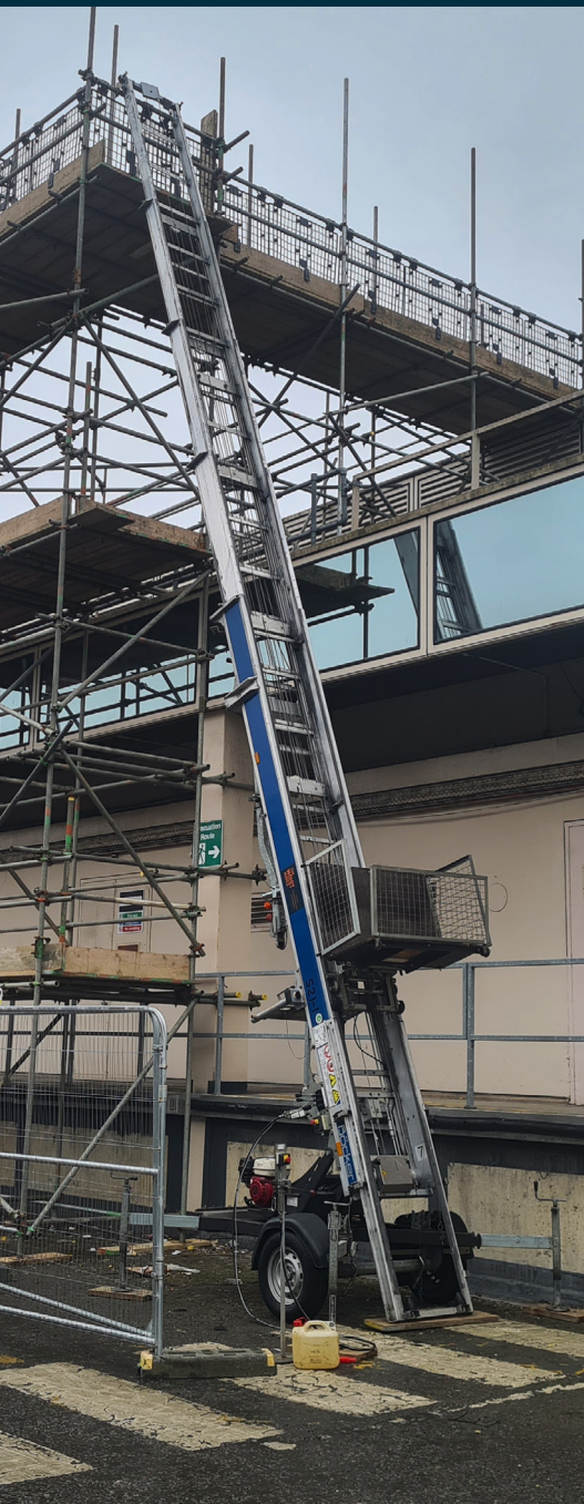
Universal Platform at ground level