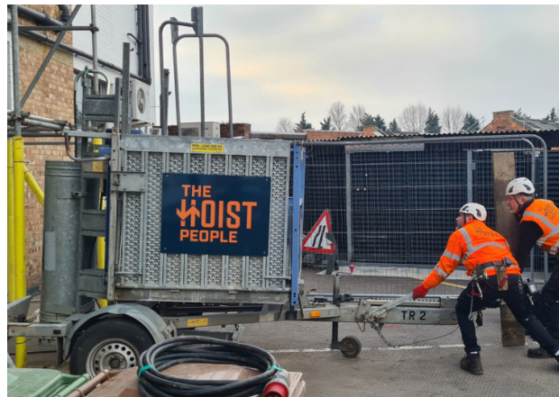
Towed to the site by trailer