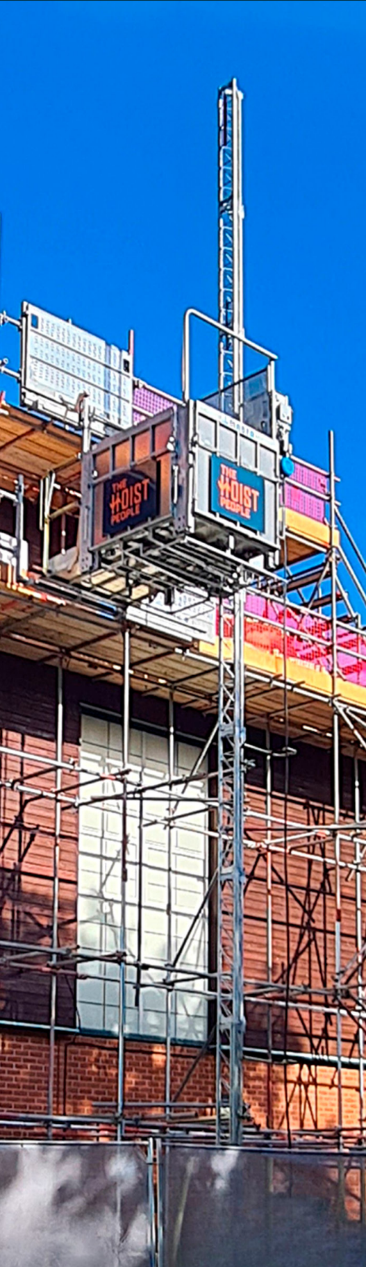
Platform at base